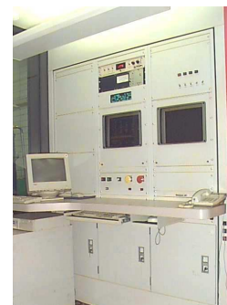
Test Console Running Cyflex

CyberMetrix 4400 Ray Boll Boulevard Columbus, Indiana 47203 phone 812-378-5903 fax 812-378-3393 visit our website at http://www.cybermetrix.com